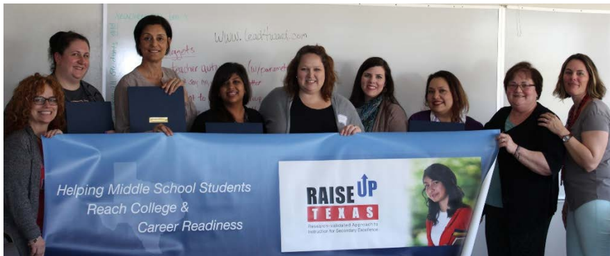
Completion Celebration on February 24, 2017!

Only two years after the start of the RAISE UP Texas Expansion, the first class of educators are now certified, through our partnership with KUCRL, to offer SIM PD to their campuses. While RAISE UP Texas incorporates many different aspects of campus transformation and includes best practices from multiple sources, the Strategic Instruction Model is foundational to all RAISE UP Texas classrooms.