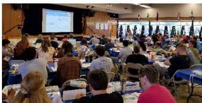
Burnet MS teachers (above) are learning about instructional tools within RAISE UP Texas while Taylor MS teachers (below) discuss different ways to use the Unit Organizer in their classrooms.

This year, three more schools ( Burnet MS- Austin ISD, Taylor MS- Taylor ISD, and Westview MS- Pflugerville ISD ) are joining RAISE UP Texas , bringing the regional total to sixteen middle schools spread across 10 Central Texas districts. In addition to our Central Texas schools, RAISE UP Texas is expanding our impact to the Bexar County area through a partnership with Region 20 and TEA. Six schools will begin implementation of RAISE UP Texas starting in 2018. We also have three schools in Fort Bend ISD participating in the first year of the RAISE UP Texas Network for schools who have finished the initial implementation and would like more support to sustain their success.