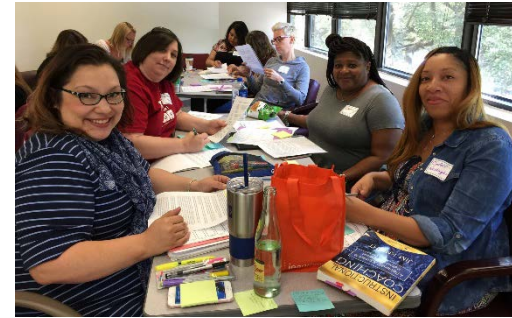
Future professional developers (above) are learning about the many ways to engage teachers in professional learning with RAISE UP Texas after experiencing team building activities during a lunch picnic (below).

For the second summer in a row, RAISE UP Texas held an institute for future Professional Developers in June 2017. Select administrators, instructional coaches and classroom teachers from RAISE UP Texas campuses studied best practices in adult learning and how to advocate for and achieve transformation on their campus. Following the three day institute, future Professional Developers are currently completing an apprentice period that includes planning and leading professional learning experiences for their campus. In only one year, RAISE UP Texas doubled the number of future Professional Developers participants to 30, up from 15 participants in 2016. Through this program, RAISE UP Texas continues to build capacity for campuses to maintain consistent RAISE UP Texas practices after the initial three-year implementation period. In addition to creating outstanding future Professional Developers to continue the work on their campus, participants during the institute also benefited from networking with others engaged in the same work to share ideas and innovations that can immediately impact student success on their campus.