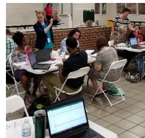
Administrators and Instructional Coaches help Westview MS teachers create their first Unit Organizer.