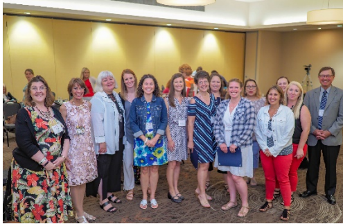
RAISE up Texas educators at the 2018 KUCRL Learning Conference

In July 2018, the Center for Research on Learning at the University of Kansas held its annual Learning Conference. In attendance were campus instructional coaches from two RAISE up Texas middle schools and an elementary instructional coach and principal