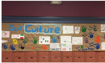
Students explore shared campus culture.

In addition to starting the year with Diamondback Camp, Dessau Middle School is trying something new in all classrooms this year. Every teacher is using a Unit Organizer to help students understand what they are learning and to follow their own progress